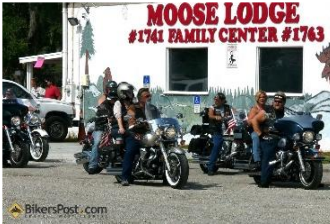
Leaving our Lodge for a fun filled day.