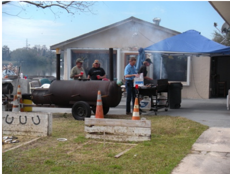
The guys were up bright and early cooking.