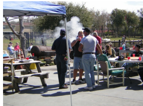
It was a beautiful day and people enjoyed being outside.